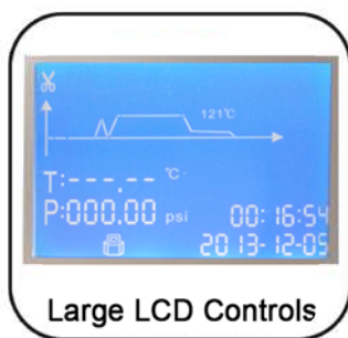
Large LCD Controls